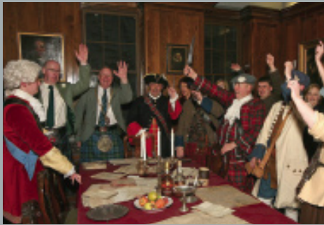
Above: Heritage Trust members vote to carry on at Derby in 2006

On 20th September 1746 the Prince left Scotland forever, to spend the rest of his life in exile in Europe.