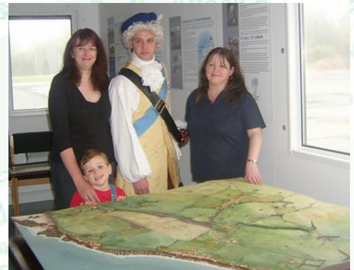
Interior of new battle visitors' centre

Working with young people to develop a short audio visual film to introduce and explain the battle, using digital technology. This will provide an opportunity for young people to learn digital recording, direction, editing and writing skills. The film will also cover the activities within the Your Heritage Grant, such as recording the community surveying, symposium extracts, and the creation / installation of the interpretive battlefield markers. Cost will include equipment, professional assistance / supervision, editing.