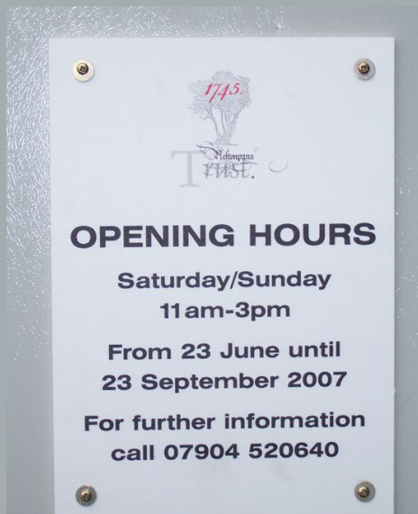
New visitor centre opening hours 2007