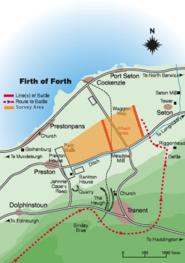
Community Fieldwork Area

This project has three key elements, 1. Community Fieldwork, 2. Community Symposium, and 3. Interpreting the Battlefield.