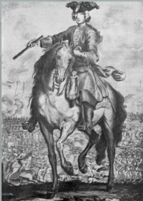
Below: Prince Charles Edward (from a contemporary engraving)