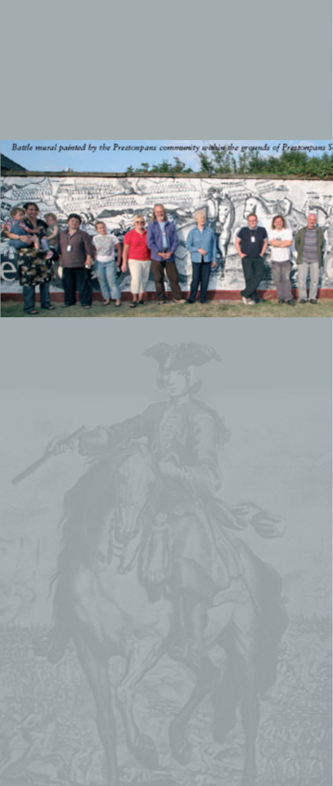
Battle mural painted by the Prestonpans community within the grounds of Prestonpans S