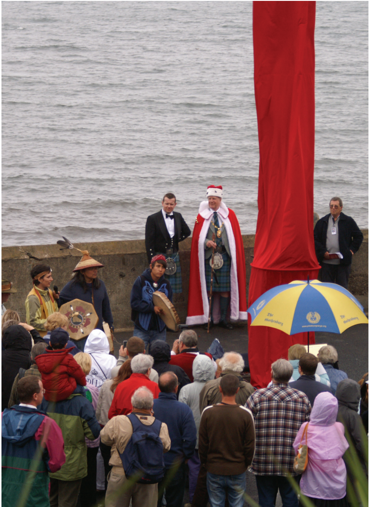
Preparations are complete and the rain drenched Raising and Unveiling Ceremony at 4 pm on August 18th 2006 is ready to begin with the Firth of Forth at full tide in the background.