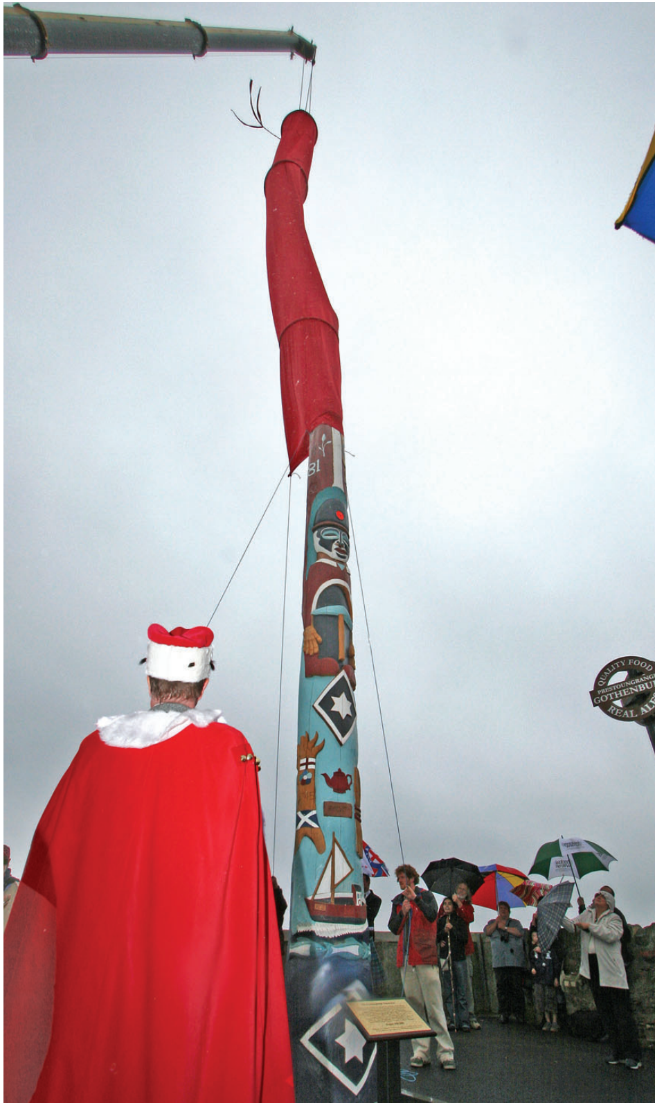
The totem story told aloud for the first time in Prestonpans and the red cloak that has been gradually raised as the story unfolded is finally lifted away.