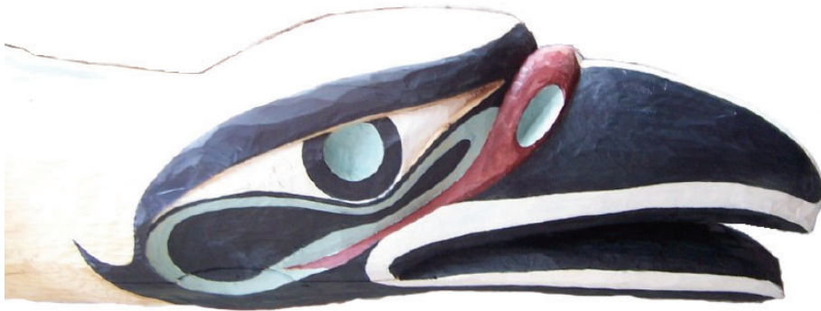
Above the carved Raven which sits atop the pole together with its painted image by Tom Ewing. Below is the carved and painted Face of The Prestonpans Miner.