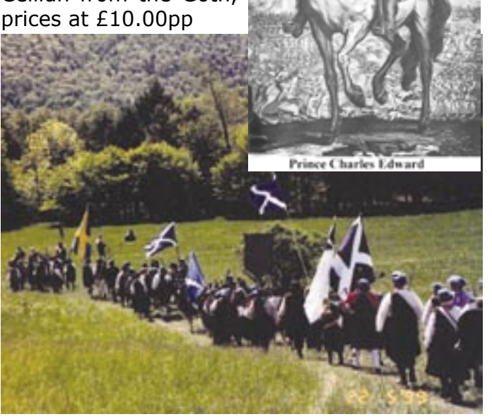
Re-enactment of the the Battle of Prestonpans, staged at Milford, USA, 2000.

of ceremonies for the evening. The Goth will be serving up a light finger buffet and plenty of dancing, so get your kilts on! Tickets are available for the Battle Ceilidh from the Goth, prices at £10.00pp