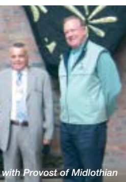
with Provost of Midlothian