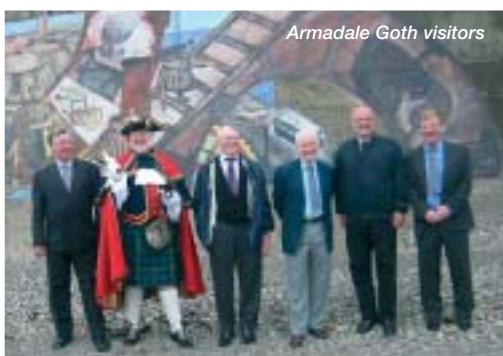
Armadale Goth visitors