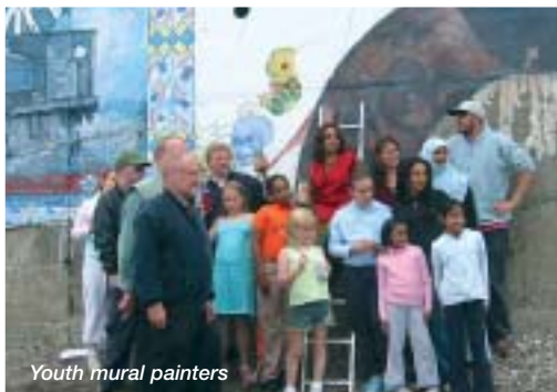
Youth mural painters