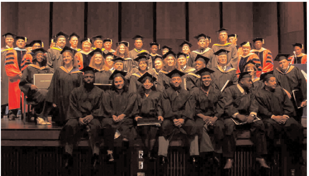
Sodexho University Class of 2003 and Faculty