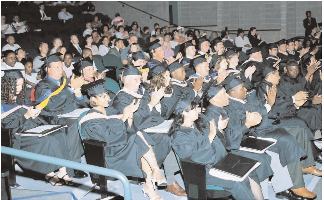
Sodexho University Class of 2003.