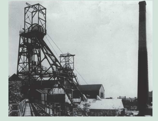
Prestongrange Colliery