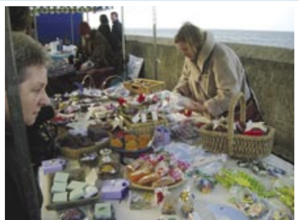
⤴ A wide range of products on display at the arts 'n crafts market