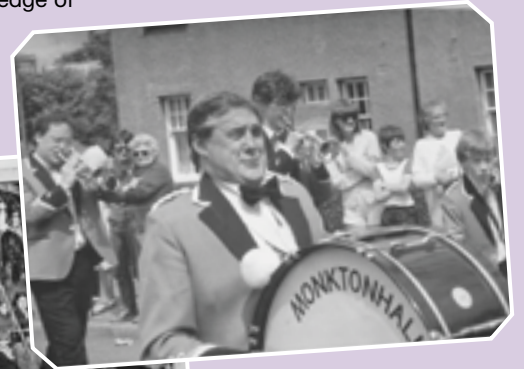
« Time to play for young and old.