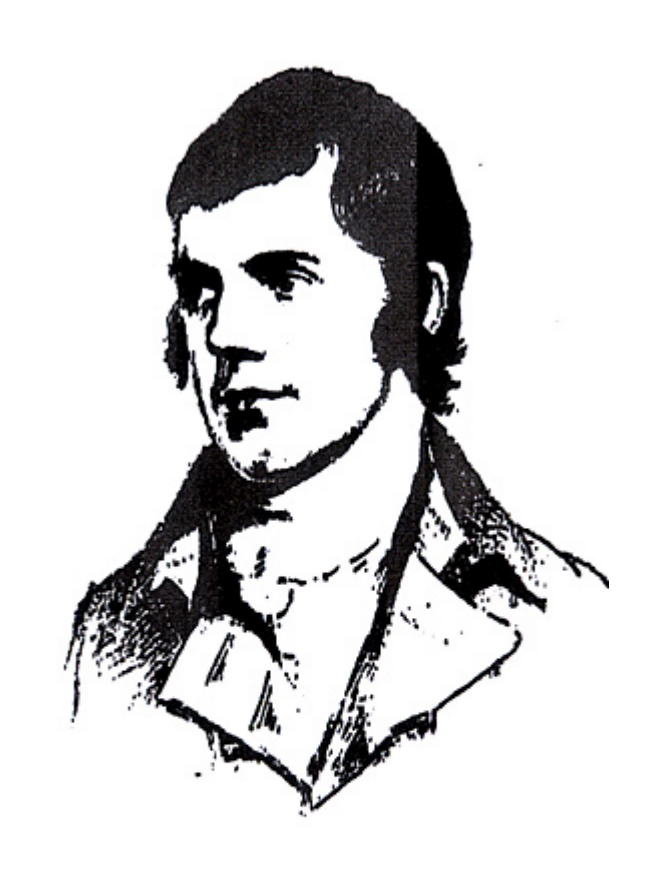
Airts Burns Club Prestonpans (516)